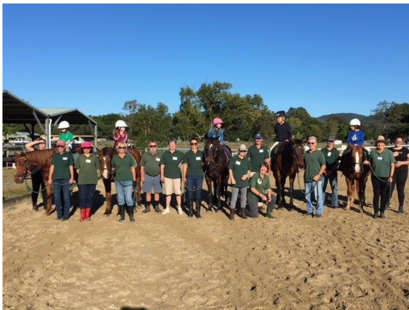
VALLEY RDA FRIDAY VOLUNTEERS